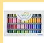
40-COLOUR EMBROIDERY THREAD SET SA740