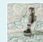
HIGH SHANK RULER FOOT SA218