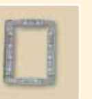
4"X7" MAGNETIC FRAME SAMF180N