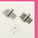
SPANISH HEMSTITCH FOOT SA220