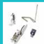
QUILT SET SAQKIT