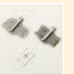
SPANISH HEMSTITCH FOOT SA220