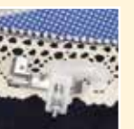
PEARL FOOT SA217

*On selected accessories. Separate purchase required.