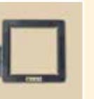
4"X4" MAGNETIC FRAME SAMFM100