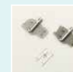
SPANISH HEMSTITCH FOOT SA220