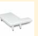
WIDE TABLE SAWT8